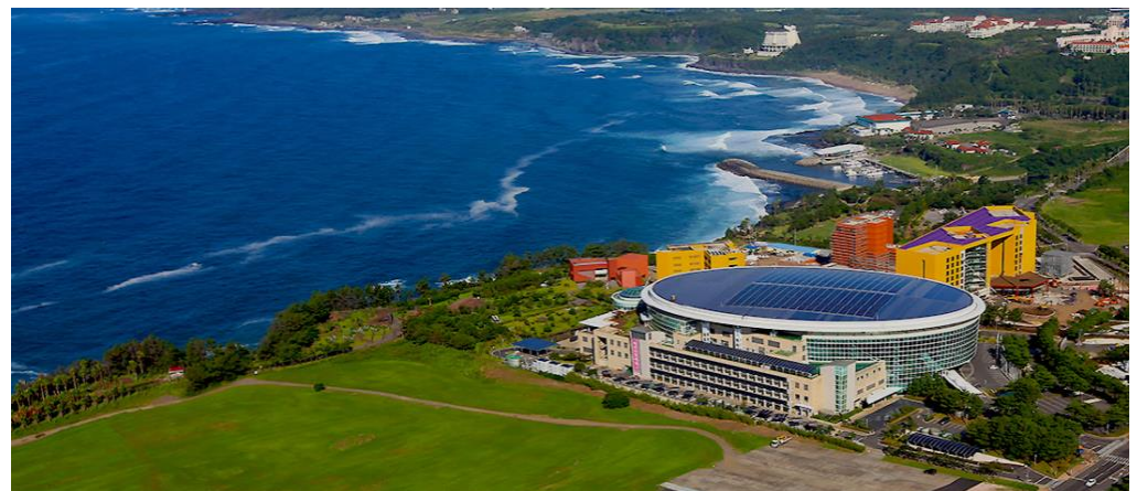
< ASCC 2021 Venue, International Convention Center, Jeju Island >

Submission Guidelines: The submission portal for ASCC 2021 will open on Oct. 1, 2020. All submissions must be made through the website at http://ascc2021.papercept.net/ . When preparing the manuscript, the authors should adhere to the IEEE style for conference paper. All submitted papers must be written in English. Accepted papers are limited to 6 pages (regular paper) and 2 pages (position paper) at no extra charge. Up to two extra pages are allowed with an additional charge. All publication material for presentation must be original and hence cannot be already published, nor can it be under review elsewhere. The authors take responsibility for the material that has been submitted.